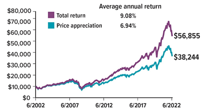
Source: Refinitiv, 2022, for the period 6/30/2002 to 6/30/2022. The S&P 500 index is an unmanaged group of securities considered representative of U.S. stocks. Expenses, fees, charges, and taxes are not considered and would reduce the performance shown if included. The performance of an unmanaged index is not indicative of the performance of any specific investment. Individuals cannot invest directly in an index. Past performance is not a guarantee of future results. Rates of return will vary over time, particularly for long-term investments. Actual results will vary.

Growth in value of a hypothetical $10,000 investment in the S&P 500 index for the 20-year period ending in June 2022, comparing price appreciation and total return, which includes reinvesting dividends.